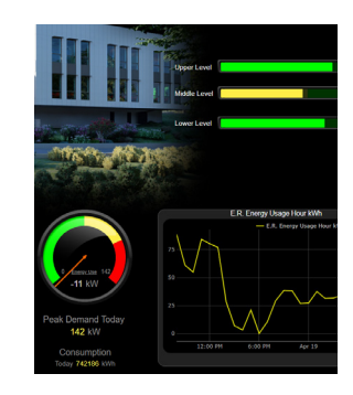
With Automated Logic's WebCTRL building automaton system, the new ASHRAE net-zero-energy global headquarters has full network control, monitoring, alarming, trending, and scheduling from one common interface.